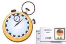
Excellent Printing Performance

The HiTi 640Amphi features an automatic temperature and humidity detection system. The system can automatically detect the temperature and humidity in the working environment, adjust relevant settings to fit the environment and ensure the HiTi 640Amphi consistently generating hi-quality & hi-stability printouts. The unrivalled function allows the HiTi 640Amphi to print in various printing environments with all kinds of conditions.