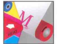
Dye Diffusion Thermal Transfer (D2T2) Technology

The HiTi 640Amphi employs Dye Diffusion Thermal Transfer (D2T2) Technology which layers Yellow, Magenta, Cyan, and Overcoating (YMCO), three color layers and one protecting overcoating, onto the photo paper or PVC card. The technology enables 16.77 Million continuous-tone true colors with 403dpi extraordinary resolution, equal to 6400dpi of the inkjet printer, making the image more refined and detailed.