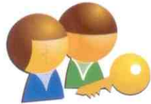
Best Solution for Employee Identification Administration