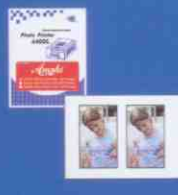
Single-Side PVC Kit 100 sheets PVC (200 card prints)