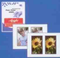
Double-Side PVC Kit 50 sheets PVC (100 card prints)