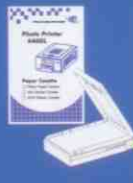
Paper Cassette PVC Cassette