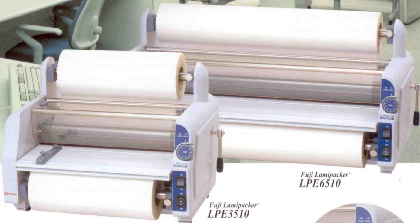
Fuji Lamipacker® LPE6510